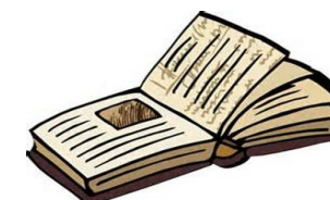
On-Line Church Directory